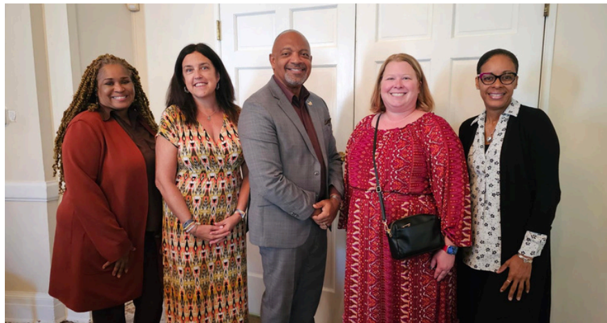
The Lieutenant Governor and his office's staff with Foster Moore US teams members

At Foster Moore, we are proud to have played a key role in this transformation and remain committed to delivering cutting-edge registry solutions worldwide.